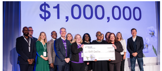
TELUS committed to awarding $1 million in grants to support youth in N.C.