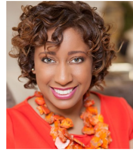
Elizabeth Trotman Foundation For The Carolinas