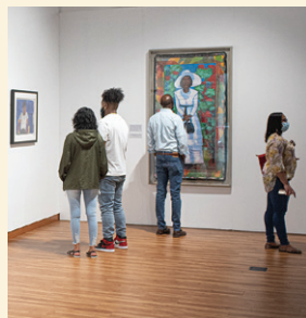
The Harvey B. Gantt Center for African-American Arts and Culture is an Infusion Fund grantee.

Recent awards from the Infusion Fund supported operations for 38 local nonprofit arts and culture organizations. For a complete list of grants: fftc.org/Arts .