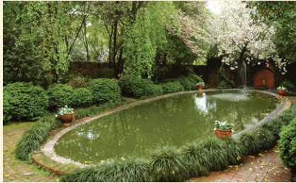
(Top): Dancers rehearse at Charlotte Ballet in Uptown Charlotte. (Bottom): The Oval Pool at the Wing Haven garden and bird sanctuary. Both nonprofits are Infusion Fund grantees.