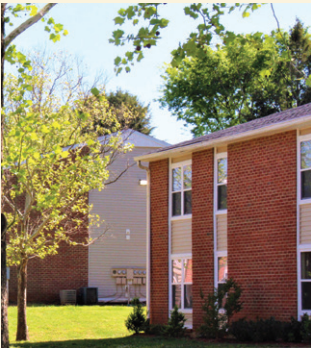
Lake Mist Apartments, a local affordable housing success story, was helped by funding from the Charlotte Housing Opportunity Investment Fund, an initiative of FFTC.

After the City of Charlotte agreed to a bond referendum to more than triple its Housing Trust Fund to $50 million – and with Charlotte facing an affordable-housing deficit ranging from 22,000-34,000 units – Foundation For The Carolinas launched a private-sector fundraising campaign three years ago. When it concluded, the campaign had raised $53 million in support of affordable housing.