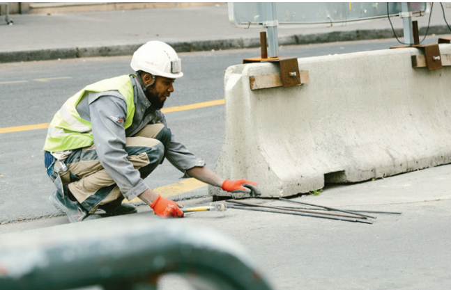
A recent program-related investment supported Bright Hope Capital LLC, an investment fund supporting minority-owned businesses in Charlotte.