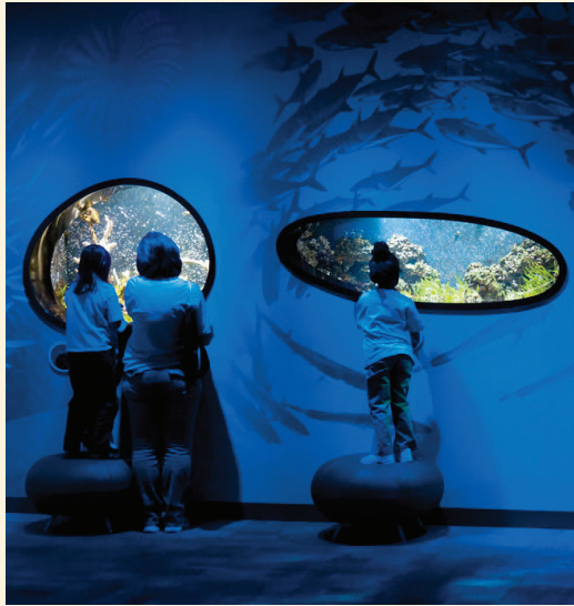
Children explore an exhibit at Discovery Place Science, located on North Tryon Street in Uptown Charlotte. Discovery Place received an operating grant from the Infusion Fund.