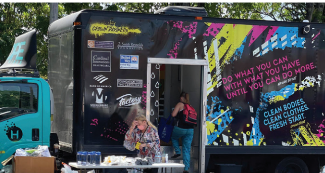
The Hope Tank, an initiative of Hope Vibes, provides mobile shower and laundromat services to Charlotte's homeless community.