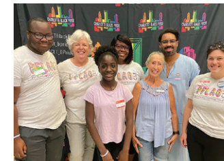
PFLAG Charlotte received a grant to support LGBTQ+ residents and their families and allies.

The Plus Collective is a collective giving program and endowment at FFTC. Since it was founded in 2004, The Plus Collective has raised and granted more than $1.6 million to local nonprofits. The most recent round of operating support grants included: