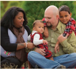
The A Way Home housing endowment has impacted hundreds of families. Watch the video: PhilanthropyFocus.org/A-Way-Home

For more information: fftc.org/Our_Initiatives