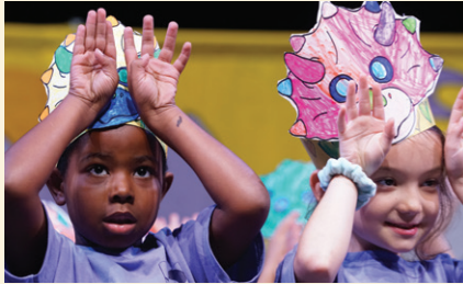
(Top): A performance by Infusion Fund grantee Brand New Sheriff Productions. (Bottom): Children's Theatre of Charlotte, also a grantee, hosts dozens of summer camps for local children every year.