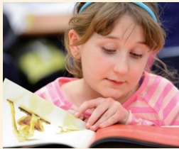
Read Charlotte is a community-wide children’s reading initiative to improve literacy from birth through third grade. For more information: ReadCharlotte.org