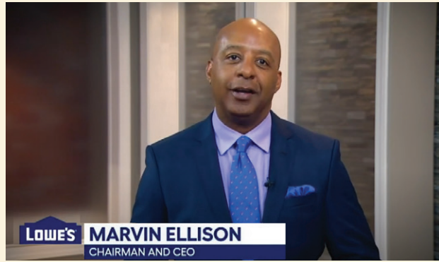
A $1 million gift from Lowe's Home Improvement helped push the Infusion Fund campaign over its initial fundraising goal of $18 million. The private-sector campaign ultimately reached $23 million, and the City of Charlotte is matching the original goal, bringing the fund total to $41 million.