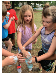
A grant to the Stanly County Family YMCA provided summer camp scholarships to local children.