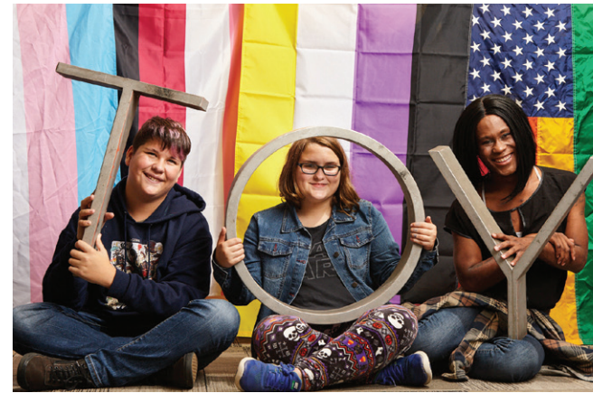
Plus Collective grantee Time Out Youth has been a safe haven for LGBTQ+ youth for years. Find out more: PhilanthropyFocus.org/TOY .

For more information: fftc.org/RegionalAffiliates