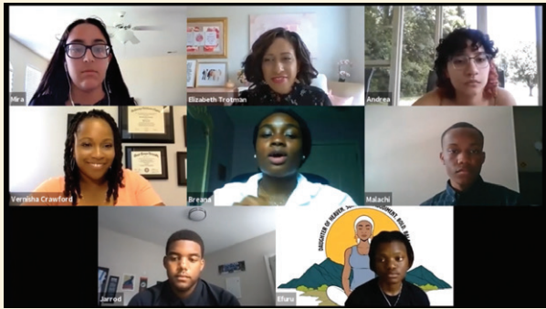
The Youth Voice webinar featured a discussion with local youth about the impact of COVID-19, racially-traumatic events, unique school environments, and ways that parents, leaders and organizations can help empower youth.

As our community continues its recovery from the pandemic, the Robinson Center for Civic Leadership is focused on some of the most pressing issues and needs such as mental health, housing and homelessness, racial equity and economic mobility.