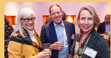
The State of the Union address also served as the 10th anniversary celebration for the Robinson Center for Civic Leadership, which was established in 2008 to address our community's greatest challenges and opportunities.