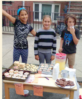
Gifts to the Hurricane Florence Response Fund came from many places, including these kids who donated funds from a bake sale they held in Brooklyn, NY.

Generous donors in our region and beyond rallied to raise money for the fund. From a $1 million gift from Michael Jordan to a $75 gift from a young girl who held a bake sale in Brooklyn, NY, donors across the nation came together to help those affected by the disaster. Numerous local retailers and restaurants also contributed by holding fundraisers and auctions to support the fund.