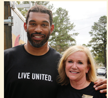
Carolina Panthers player Julius Peppers created a relief fund with a gift of $100,000, inspiring others to join the effort. He followed up by returning to Eastern North Carolina to volunteer his time with the United Way.