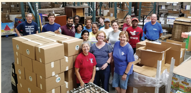
Harvest Hope Food Bank was awarded a $25,000 grant for food aid from the Hurricane Florence Response Fund.

You can continue to support future grants by donating at www.ffc.org/HurricaneResponse