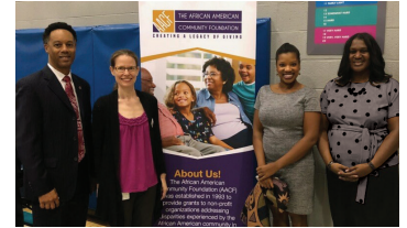
The African American Community Foundation supported the Urban League of Central Carolinas' career fair.

AACF is a grantmaking program managed by Foundation For The Carolinas and made possible through the Lethia Henderson Fund Endowment and the Elizabeth S. Randolph African American Fund Endowment.