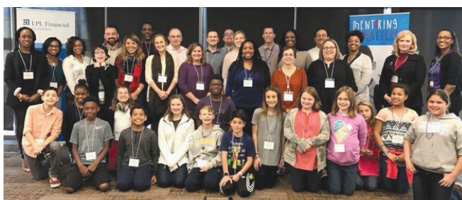
Big Brothers Big Sisters of Central Carolinas received a $5,000 grant to expand its one-on-one mentoring program between York County students and corporate leaders.

Read more at www.ffmpeg.org/regional_affiliates