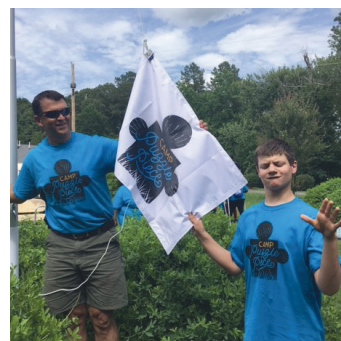
GHA Autism Supports was one of the beneficiaries of Stanly County’s increased grant funding this year. The nonprofit used the funds to support Camp Puzzle Piece, an outdoor summer day program for children with autism.